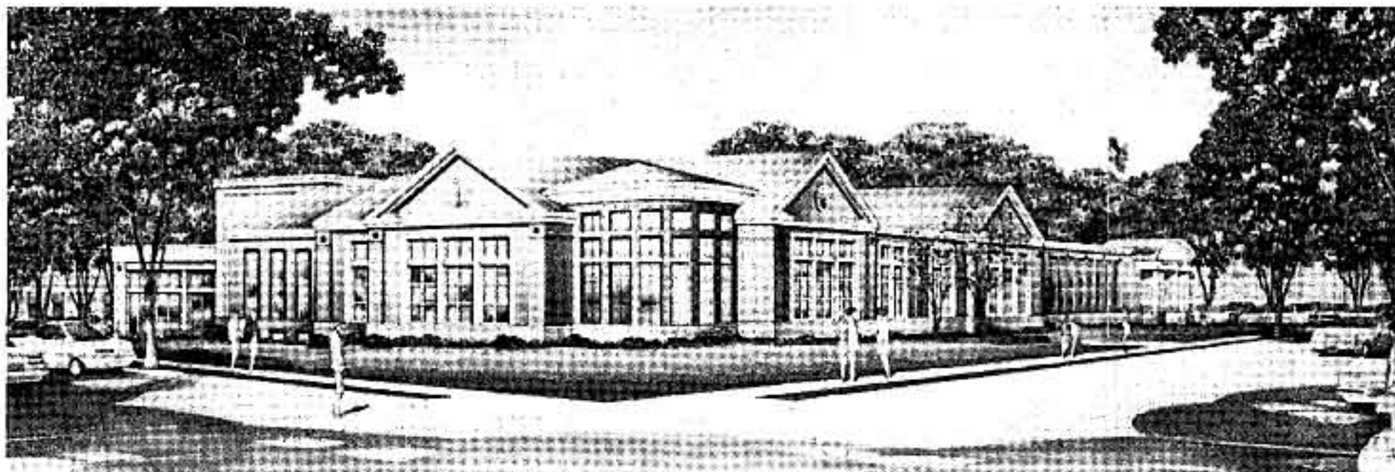
Renovated and Expanded Library 1999 -

Capping the community's two-year fund raising campaign for the library was the performance of a city-wide musical: Meredith Wilson's "The Music Man." Auditions were held in April and performances were given