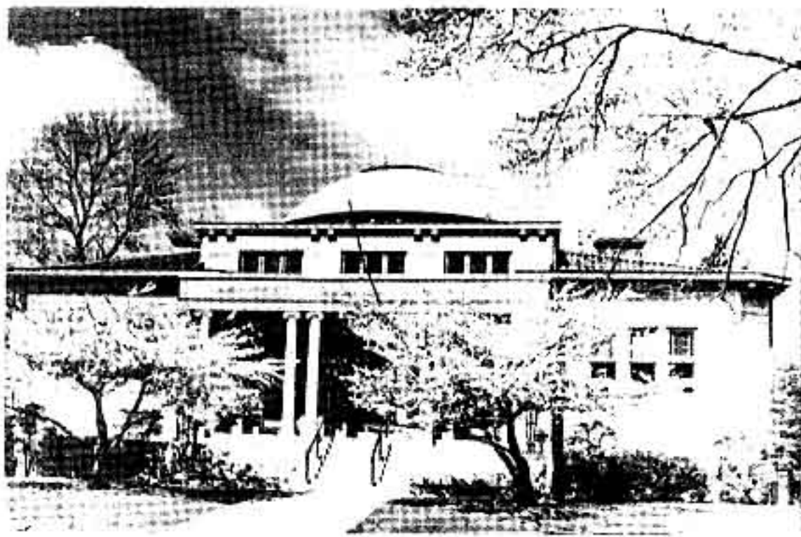
Carnegie Library 1911 - 1964

The building was described as "an impressive building constructed of terra cotta block with pressed Philadelphia brick veneering. The roof was Spanish