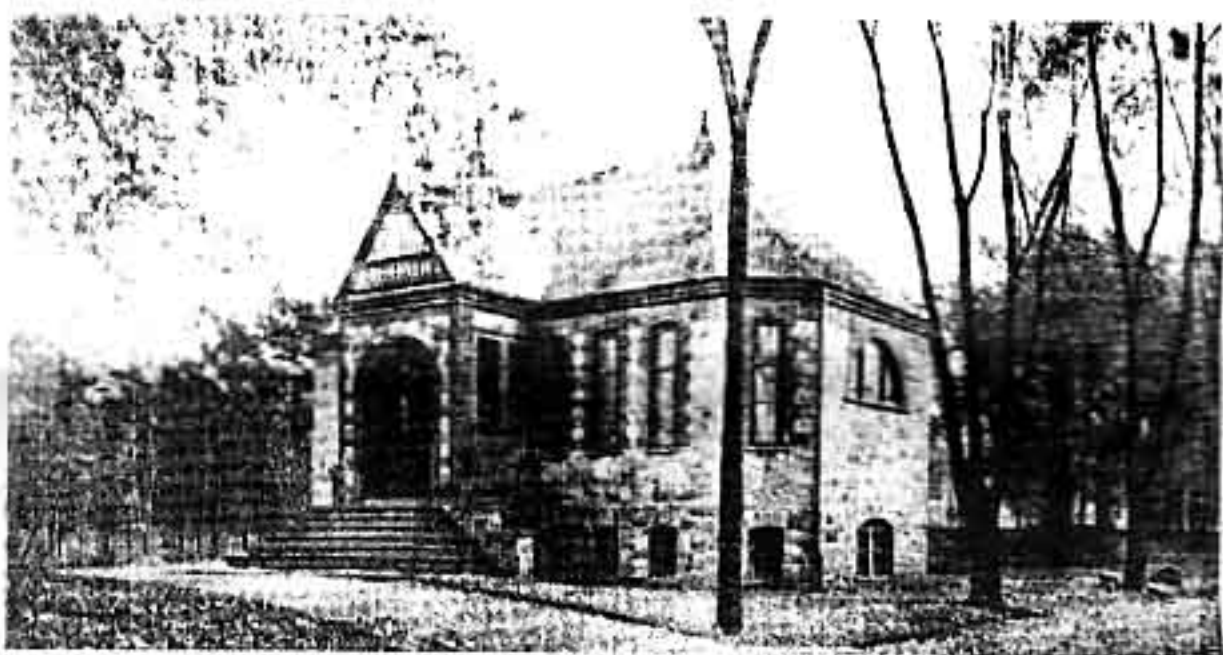
First Library 1891 - 1911

An appeal to the community gradually gained support. New subscriptions were given and the Town Council made an annual subscription of $150.